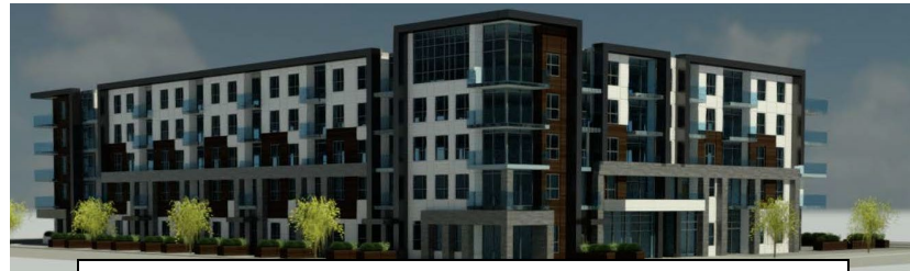
The above image represents the applicant’s proposal as submitted and may change

Dated at the Municipality of South Huron this 2nd day of September, 2022